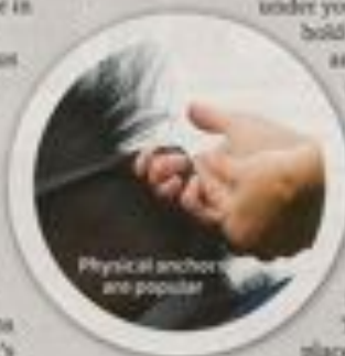
Vicky asks people to track back through their memories

At the height of your happy feeling put in place an anchor - this is a physical action such as pinching your hand or arm. Practise using your anchor and eventually it will create an automatic link or trigger to your positive, happy emotion.